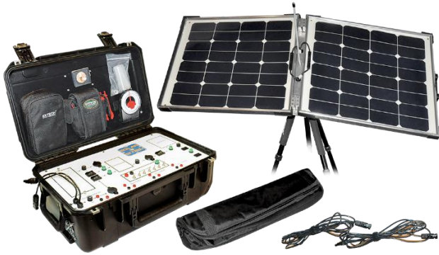
solar4STEM ® 200 P/N 0015231-001