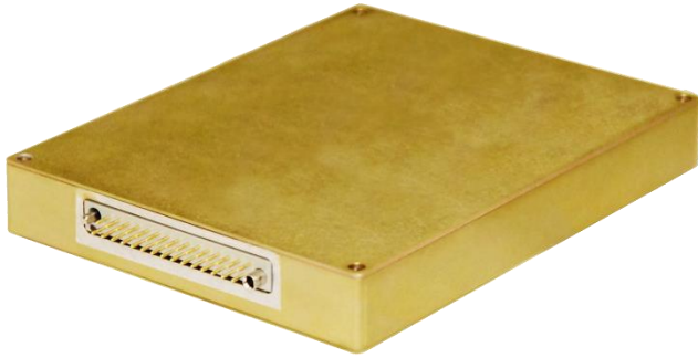
Low Voltage, Low Profile, Multi-Output (3 Outputs Standard) Power Supply Module (Up to 125W)