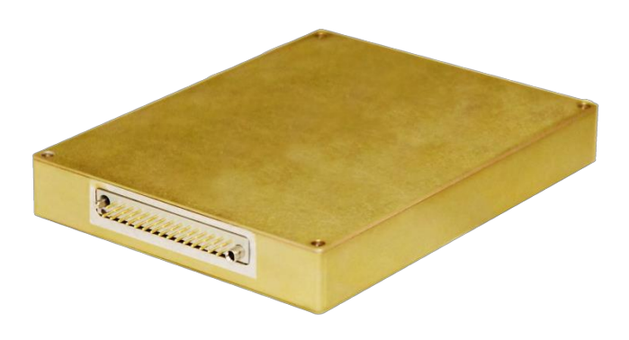
Low Voltage, Low Profile, Multi-Output (3 Outputs Standard) Power Supply Module (Up to 125W)