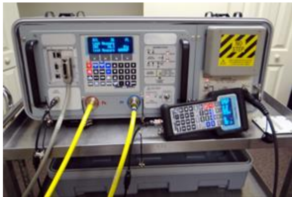
Air Data Test Set Calibration & Repair Services

As an A2LA accredited ISO 17025 Calibration Lab, CME may issue Certificates of Compliance (CoC) on all calibrations which are to NIST traceable standards.