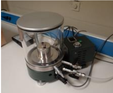
NIST Traceable Primary and Transfer Standards